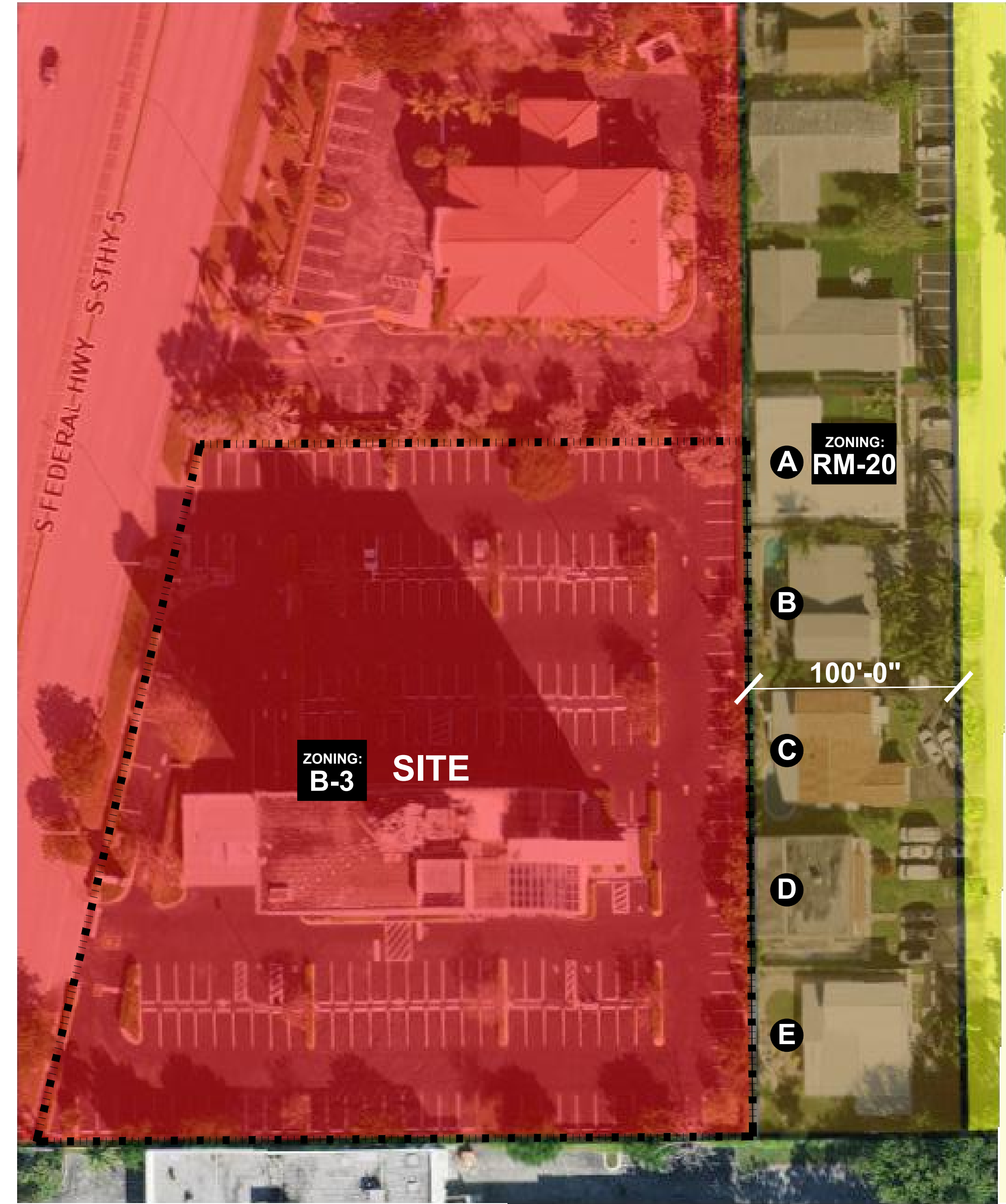
01 ADJACENT ZONING DIAGRAM A-004A SCALE: NTS