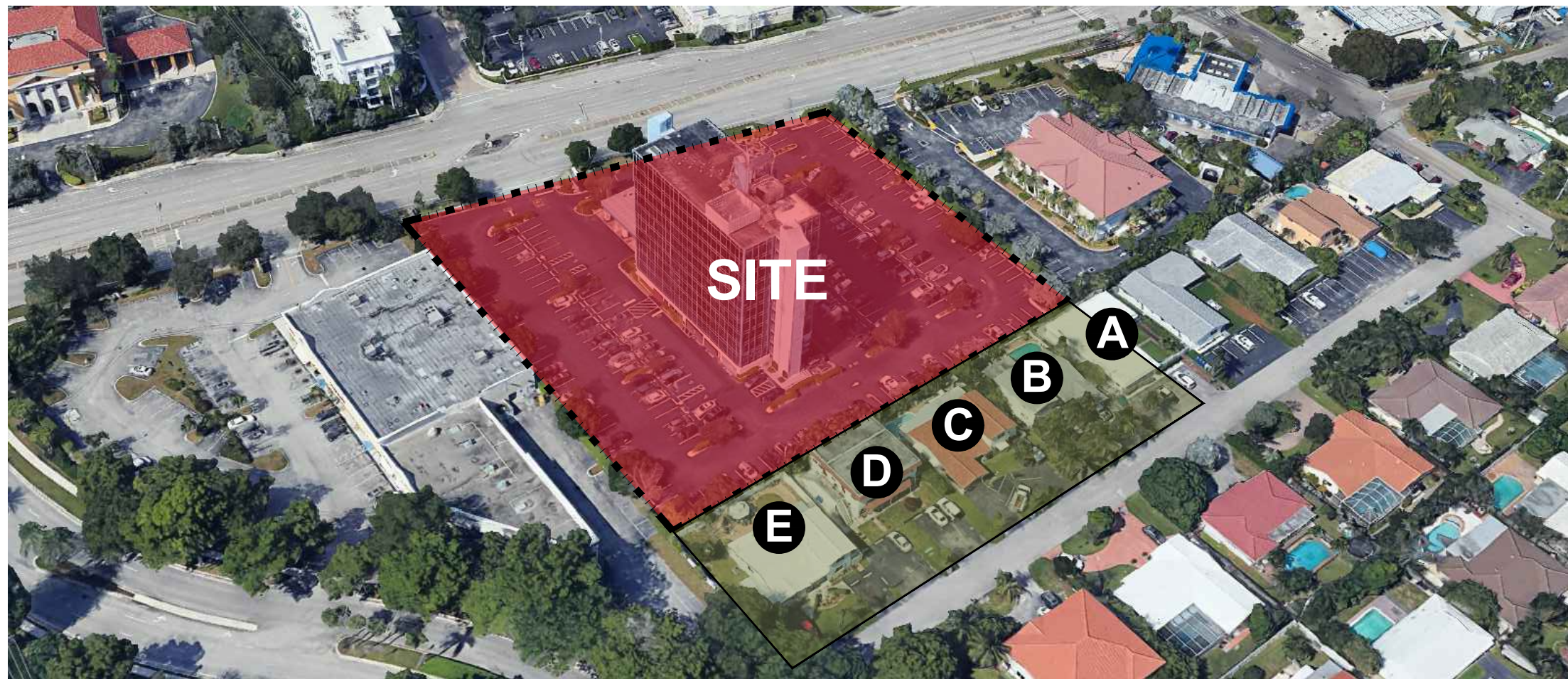
02 ADJACENT ZONING DIAGRAM A-004A SCALE: NTS